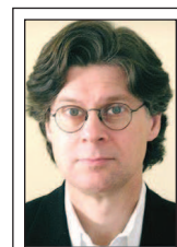
BYRON YORK Comment

There is much discussion about the intensity of Democratic opposition to President Trump, and indeed Democrats showed a lot of fundraising enthusiasm in the losing Georgia