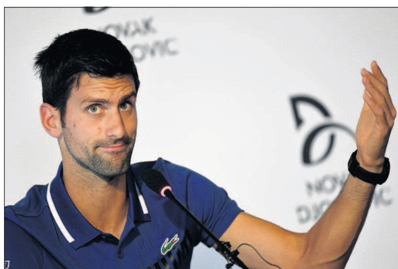
Tennis player Novak Djokovic gestures, during a press conference in Belgrade, Serbia, Wednesday, July 26, 2017. Djokovic will sit out the rest of this season because of an injured right elbow, meaning he will miss the U.S. Open and end his streak of participating in 51 consecutive Grand Slam tournaments.

Since entering his first major tournament at the 2005 Australian Open, Djokovic has never missed