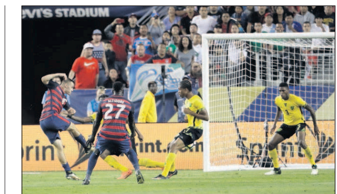
United States' Jordan Morris scores the game-winning goal against Jamaica during the Gold Cup final in Santa Clara, Calif., Wednesday, July 26, 2017.