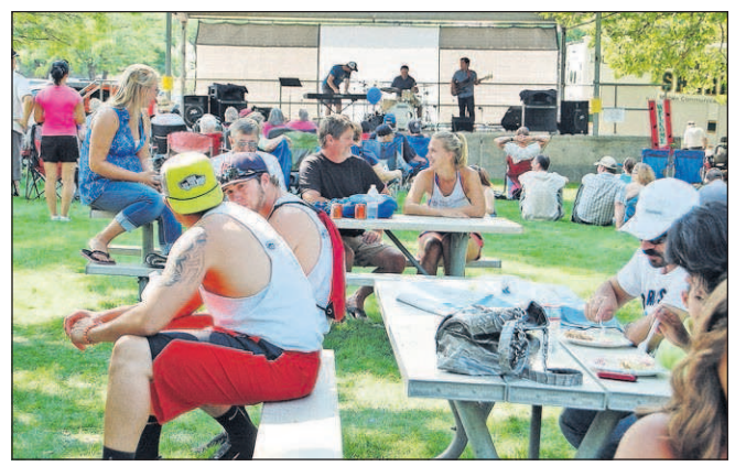
People visit and enjoy food while listening to music during a past Irrigon Watermelon Festival. This year's event is Saturday at Irrigon Marina Park.

Watermelons and more are featured during the 33rd annual Irrigon Watermelon Festival. The event kicks off Saturday from 6:30-10 a.m.