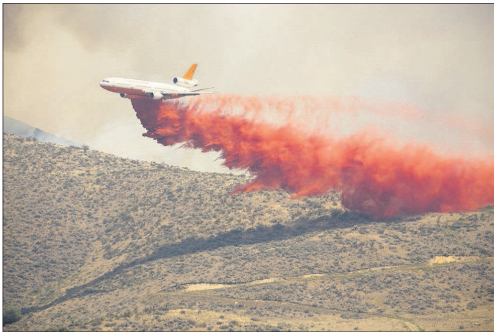
The Umatilla, Wallowa-Whitman and Malheur national forests have implemented Phase B public use restrictions to protect against wildfire.

In addition to restrictions on campfires, Phase B prohibits the use of chainsaws or other internal combustion engines on the forests. Generators are allowed, but only if they are placed in a pickup truck bed or in areas cleared of flammable material within a 10-foot diameter.