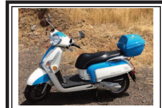
2013 KYMCO "like 200i" Scooter. 1565 miles. $1050.00 OBO Call 541-215-0824