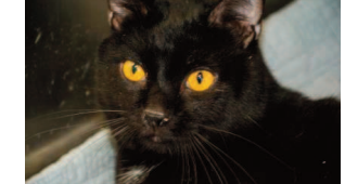
Eclipse is a 3 year old male Domestic Short Hair Mix

Available for adoption at PAWS 517 SE 3rd St.