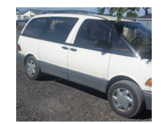
97 TOYOTA Previa 162,000 miles. Clean, runs great. $3500.00 541-720-3446