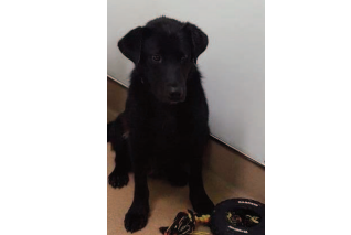
Koby is a 1 year old male Lab/ Retriever Mix

Available for adoption at PAWS 517 SE 3rd St.