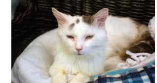
Mirrak is a 2 year old male Domestic Medium Hair Mix

Available for adoption at PAWS 517 SE 3rd St.