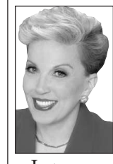
JEANNE PHILLIPS Advice

Dear Abby: I don't know what to do. I was having an affair with the most wonderful (married) man. I'm sure that he and I were the only ones who knew. He passed away unexpectedly a few years ago. I still go to the place where we met and hung out together. In my mind, I see him walking in and speaking his last words to me.