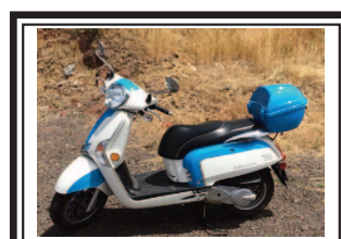
2013 KYMCO "like 200i" Scooter. 1565 miles. $1050.00 OBO Call 541-215-0824