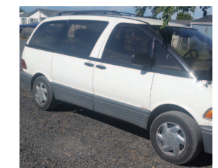
97 TOYOTA Previa 162,000 miles. Clean, runs great. $3500.00 541-720-3446