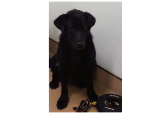
Koby is a 1 year old male Lab/ Retriever Mix

Available for adoption at PAWS 517 SE 3rd St.