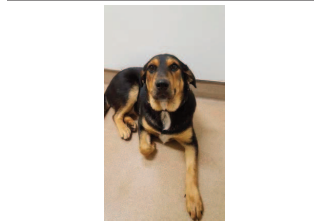
Aurora is a 1 year old female Rottweiler/ Lab/ Retriever Mix

Available for adoption at PAWS 517 SE 3rd St.