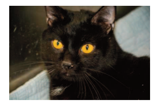
Eclipse is a 3 year old male Domestic Short Hair Mix

Available for adoption at PAWS 517 SE 3rd St.