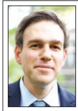
BRET STEPHENS Comment

■ Bret Stephens won a Pulitzer Prize for commentary in 2013. He began working as a columnist at The New York Times in April.