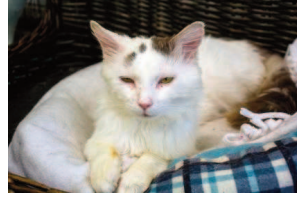
Mirrak is a 2 year old male Domestic Medium Hair Mix

Available for adoption at PAWS 517 SE 3rd St.