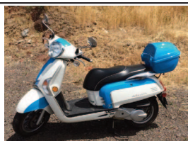
2013 KYMCO "like 200i" Scooter. 1565 miles. $1050.00 OBO Call 541-215-0824