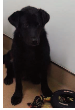
Koby is a 1 year old male Lab/ Retriever Mix

Available for adoption at PAWS 517 SE 3rd St.