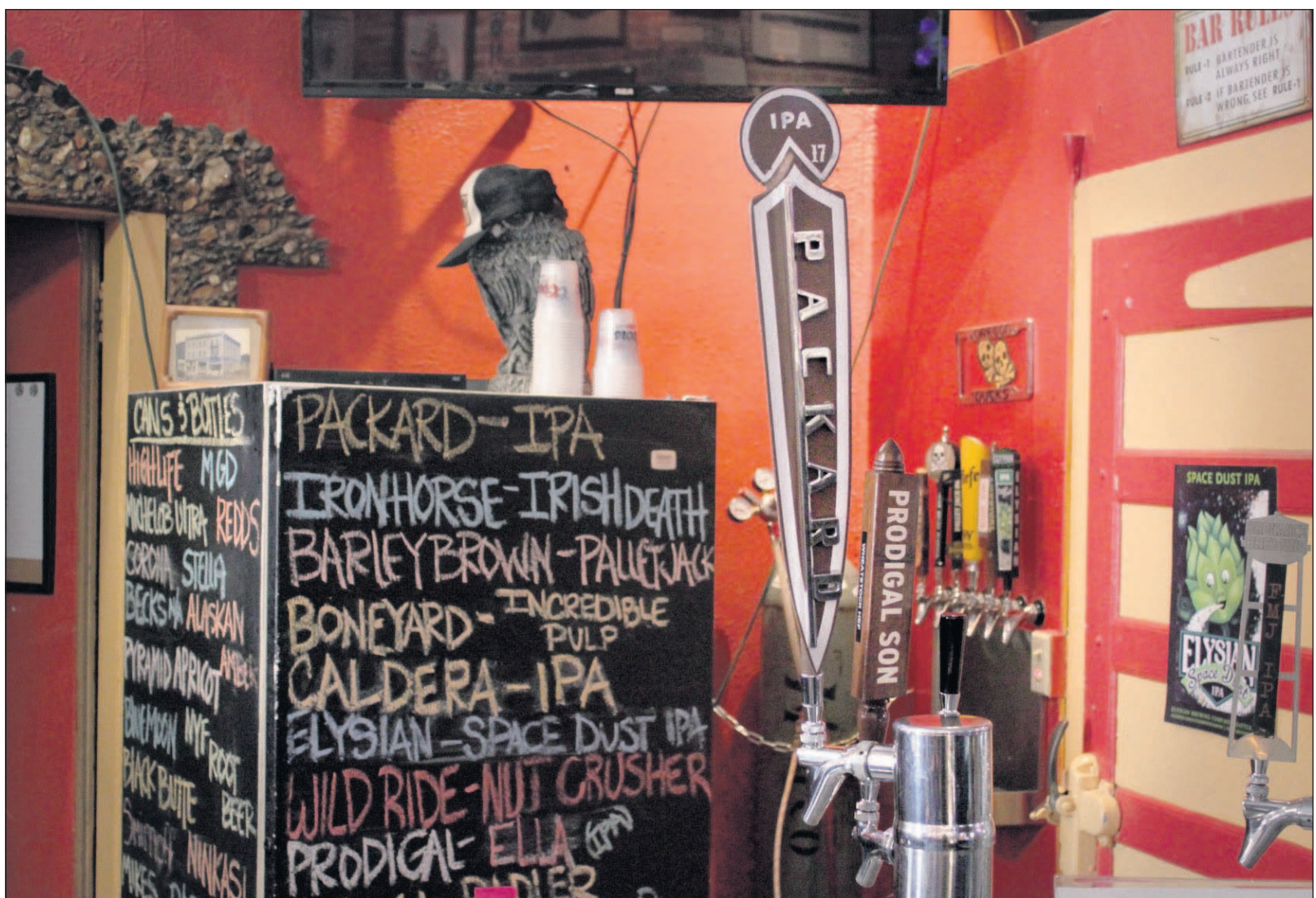
The Packard Tavern recently started serving a new IPA named after the Pendleton bar and brewed down the street at the Prodigal Son Brewery and Pub.