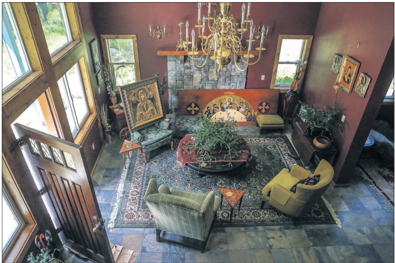
The door stands open to the main sitting room at the Duchovny Dom Byzantine Catholic Mens Monastery.