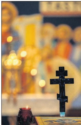
A cross is backlit by candlelight during Tuesday morning worship at the Duchovny Dom Byzantine Catholic Mens Monastery.

There also is Stanichar's rose garden, where softball-size red blossoms