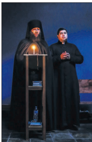
Two monks at the Duchovny Dom Byzantine Catholic Mens Monastery chant during morning worship.