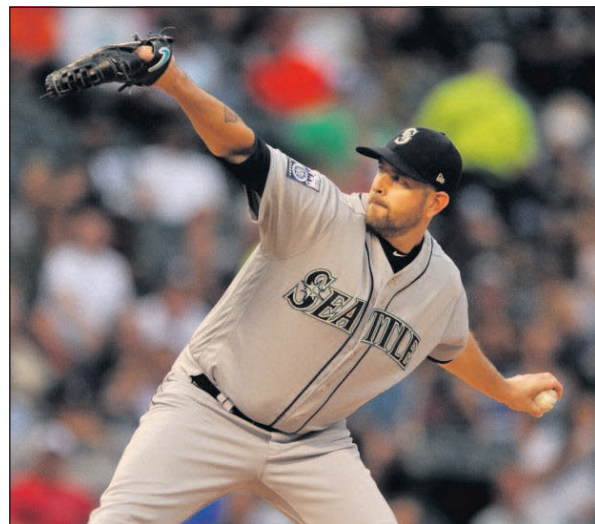
Seattle Mariners starter James Paxton delivers a pitch during the first inning of a baseball game against the Chicago White Sox Friday, July 14, 2017, in Chicago.