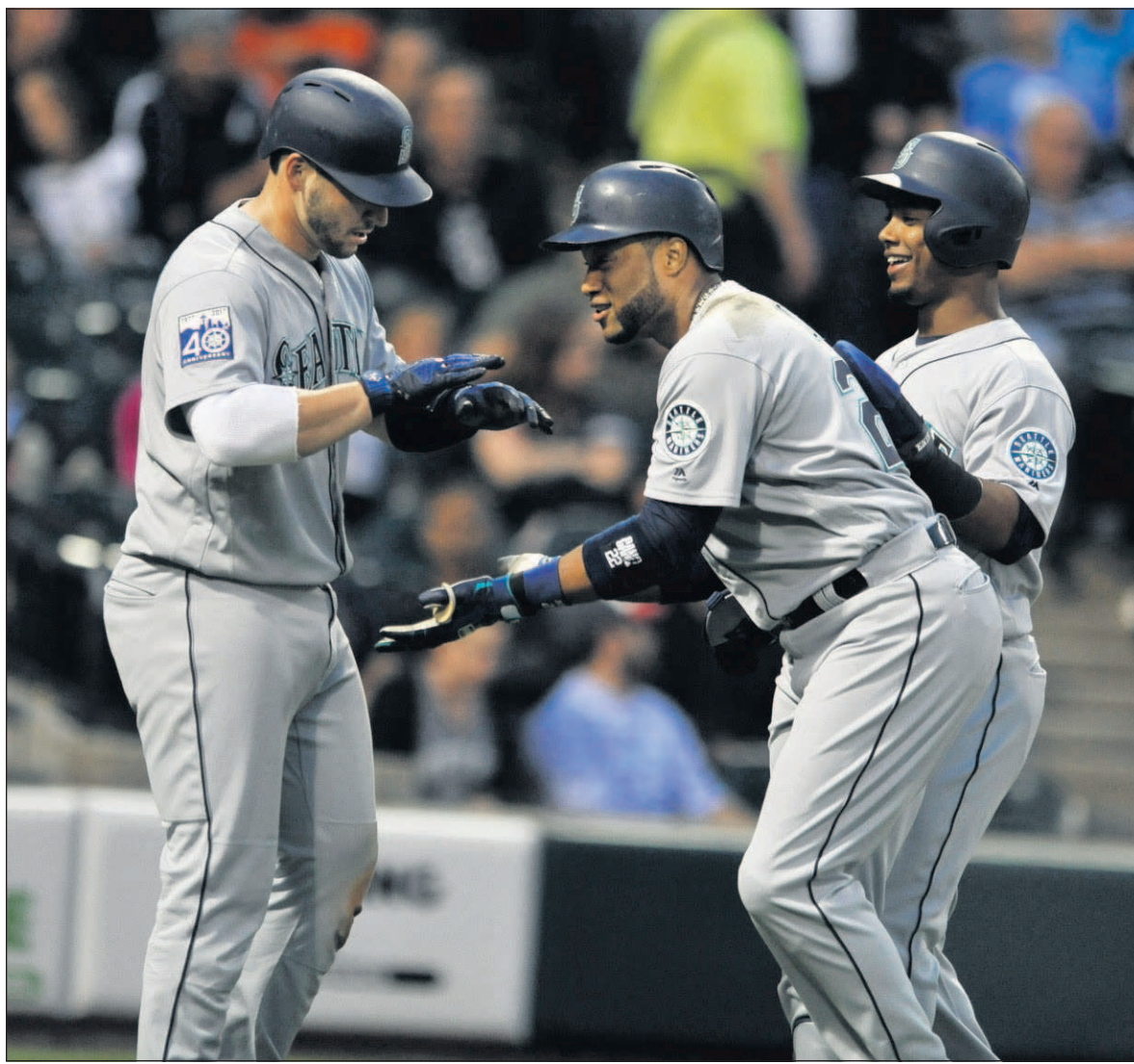
Seattle Mariners' Robinson Cano center, celebrates with teammates Jean Segura, right, and Nelson Cruz, left, at home plate after hitting a three-run home run during the third inning of a baseball game against the Chicago White Sox, Friday, July 14, 2017, in Chicago.