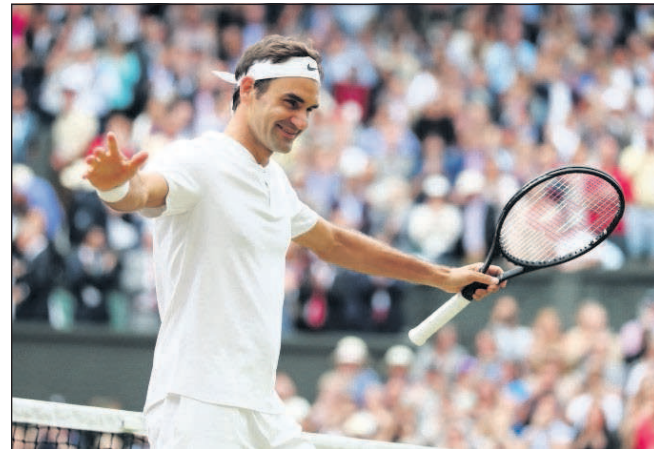
Switzerland's Roger Federer celebrates after beating Czech Republic's Tomas Berdych after winning their Men's Singles semifinal match on day eleven at the Wimbledon Tennis Championships in London, Friday, July 14, 2017.

LONDON — They love their history around these parts and they love Roger Federer and, above all, they love watching him make history. Now he stands one victory from an unprecedented eighth Wimbledon men's singles championship after qualifying for his 11th appearance in the final.