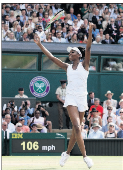
Venus Williams of the United States celebrates after beating Britain's Johanna Konta in their Women's Singles semifinal match on day nine at the Wimbledon Tennis Championships in London Thursday, July 13, 2017.