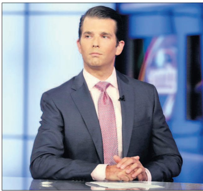
Donald Trump Jr. is interviewed by host Sean Hannity on his Fox News Channel television program, in New York Tuesday. Donald Trump Jr. eagerly accepted help from what was described to him as a Russian government effort to aid his father's campaign with damaging information about Hillary Clinton, according to emails he released publicly on Tuesday.