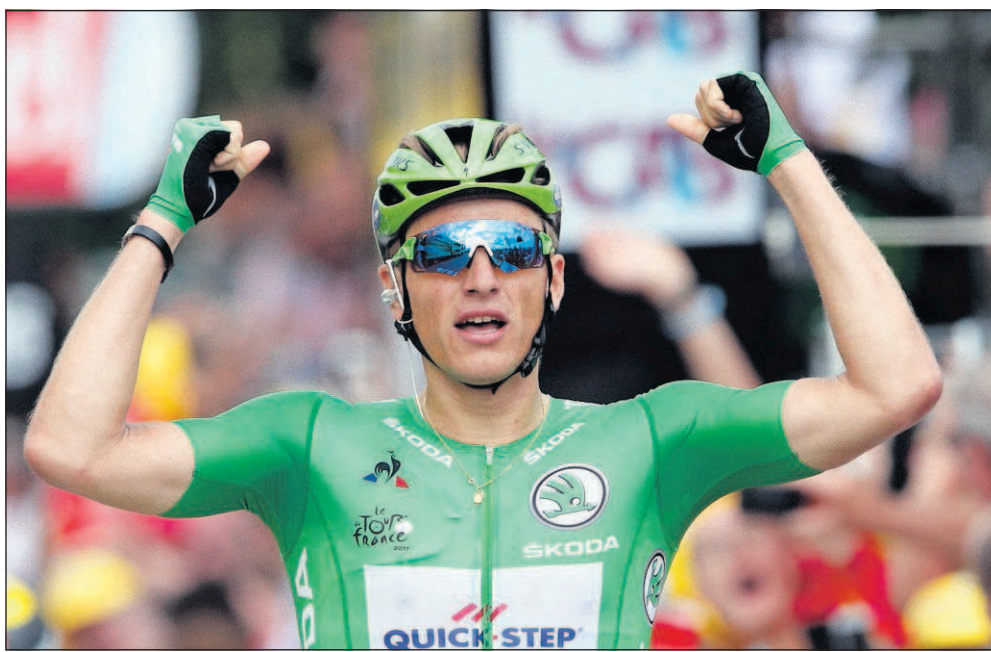
Germany's Marcel Kittel, wearing the best sprinter's green jersey celebrates as he crosses the finish line to win the tenth stage of the Tour de France cycling race over 178 kilometers (110.6 miles) with start in Perigueux and finish in Bergerac, France, Tuesday, July 11, 2017.

Kittel was in 10th place after negotiating the two sharp