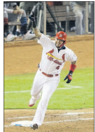
National League's St. Louis Cardinals catcher Yadier Molina (4) rounds the bases after hitting a homerun in the sixth inning, during the MLB baseball All-Star Game, Tuesday, July 11, 2017, in Miami.

pitcher in an All-Star Game, set by Dizzy Dean in 1934.