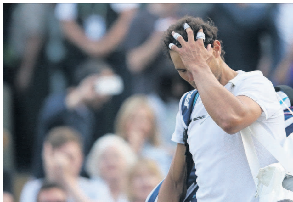
Spain's Rafael Nadal leaves the court after losing to Luxembourg's Gilles Muller in their Men's Singles Match on day seven at the Wimbledon Tennis Championships in London Monday, July 10, 2017.

After repeatedly digging himself out of difficult situations, Nadal finally succumbed, broken in the last game of a 6-3, 6-4, 3-6, 4-6, 15-13 loss to Muller on