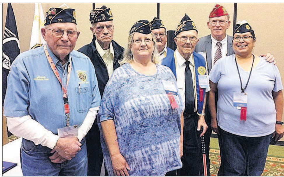
Members of District 6 American Legion posts recently attended the 99th annual Oregon State Convention, held June 20-24 in Florence.

The American Legion is the nation's largest veteran's service organization. It's committed to mentoring youth and sponsorship of wholesome programs in our communities, advocating patriotism and honor, and continued devotion to our fellow service members and veterans. The Legion