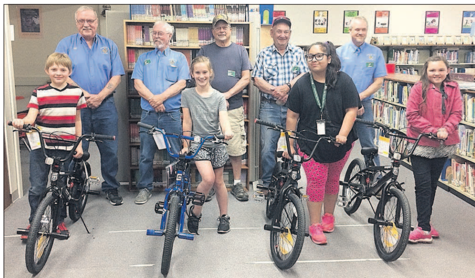
Students from Highland Hills Elementary School receive bicycles as part of the Hermiston Masonic Lodge's Bikes for Books program.