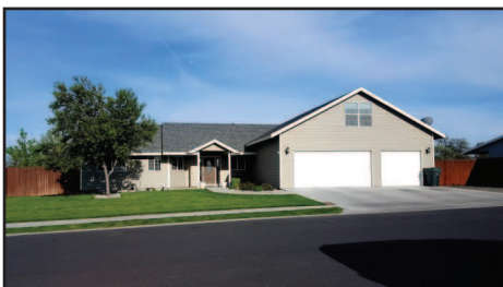
Enjoy s'mores by the firepit this summer! Huge 100x100 lot, RV Parking, Bonus room above garage, 4 bdrm, 2 bath, vaulted ceilings, new updated cabinets throughout home, Gas FP, TUGS, Fenced. Priced at $269,900 MLS#17177886