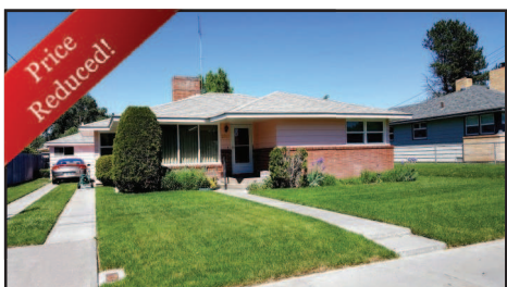
Well maintained 3bd/2ba home. Living room with gas FP, formal dining, kitchen and informal eating area, covered patio, storage area. Nicely landscaped and fenced yard. MLS#17090086 REDUCED TO $168,900