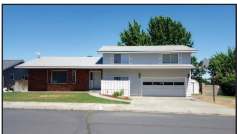
New ext paint, remodeled master bath, laminate floor throughout, 4bdrm, 2.5 baths, RV Parking, 6x12 storage shed, extended bay in garage for workshop, fenced, cov patio & lg deck. A lot of value in this home for just $239,999. MLS#17591987