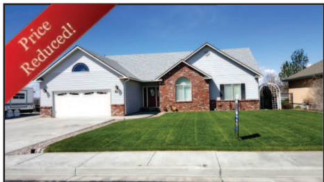
Columbia River View, Huge RV Parking, Spacious Master Suite! 1943 sf, 3bd/2ba, granite counters in kitchen, large dining, living room w/gas FP. Raised deck off master plus a covered deck off dining. Come take a look today! MLS#17530409 REDUCED TO $269,000