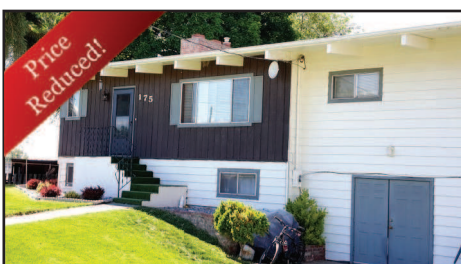
Wide open space in this 3090 sf home with 5 bd/2.5ba sitting on .45 acres! Living & Family rooms and (2) fireplaces. Fenced yard. New carpet upstairs & lower level to be at closing. MLS#17338835 REDUCED TO $211,999