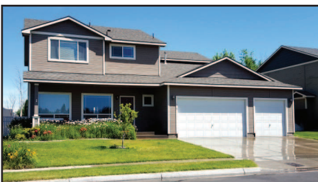
Need room? Here's 5 bdrm + office and 2.5 bath home! Spacious kitchen w/bar & pantry, granite sq tile counters, gas FP in living area. Giant covered concrete patio for BBQ's, garage w/11' ceilings & 8' rollup doors. Price at $269,900 MLS#17575724