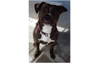
Piper is a 2 year old female Terrier/ American Pit Bull Mix

Available for adoption at PAWS 517 SE 3rd St.