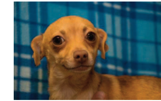
Mocha is a 1 year old female Chihuahua Mix

Available for adoption at PAWS 517 SE 3rd St.