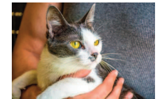
Glitter is a 2 year old female Domestic Shorthair Mix

Available for adoption at PAWS 517 SE 3rd St.