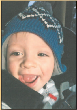
Shepherd Mr Happy Guy