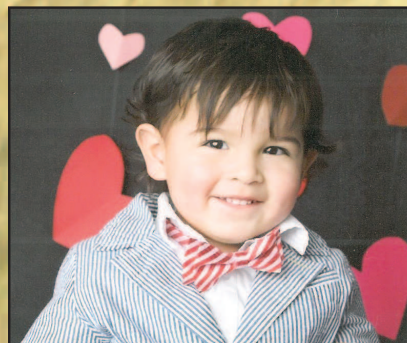
Angel You really are an "Angel" We love you very much! You are a smart handsome boy! We love U!