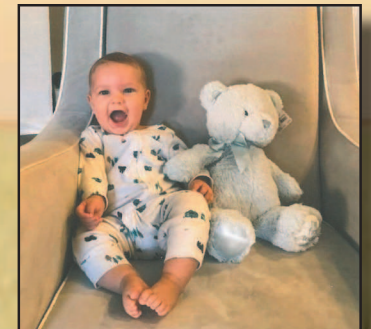
Kyrie Let me announce I'm here