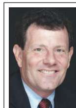
NICHOLAS KRISTOF Comment

It's true that American hospitals have the finest diagnostic equipment and the best specialists, but we falter at basics and at