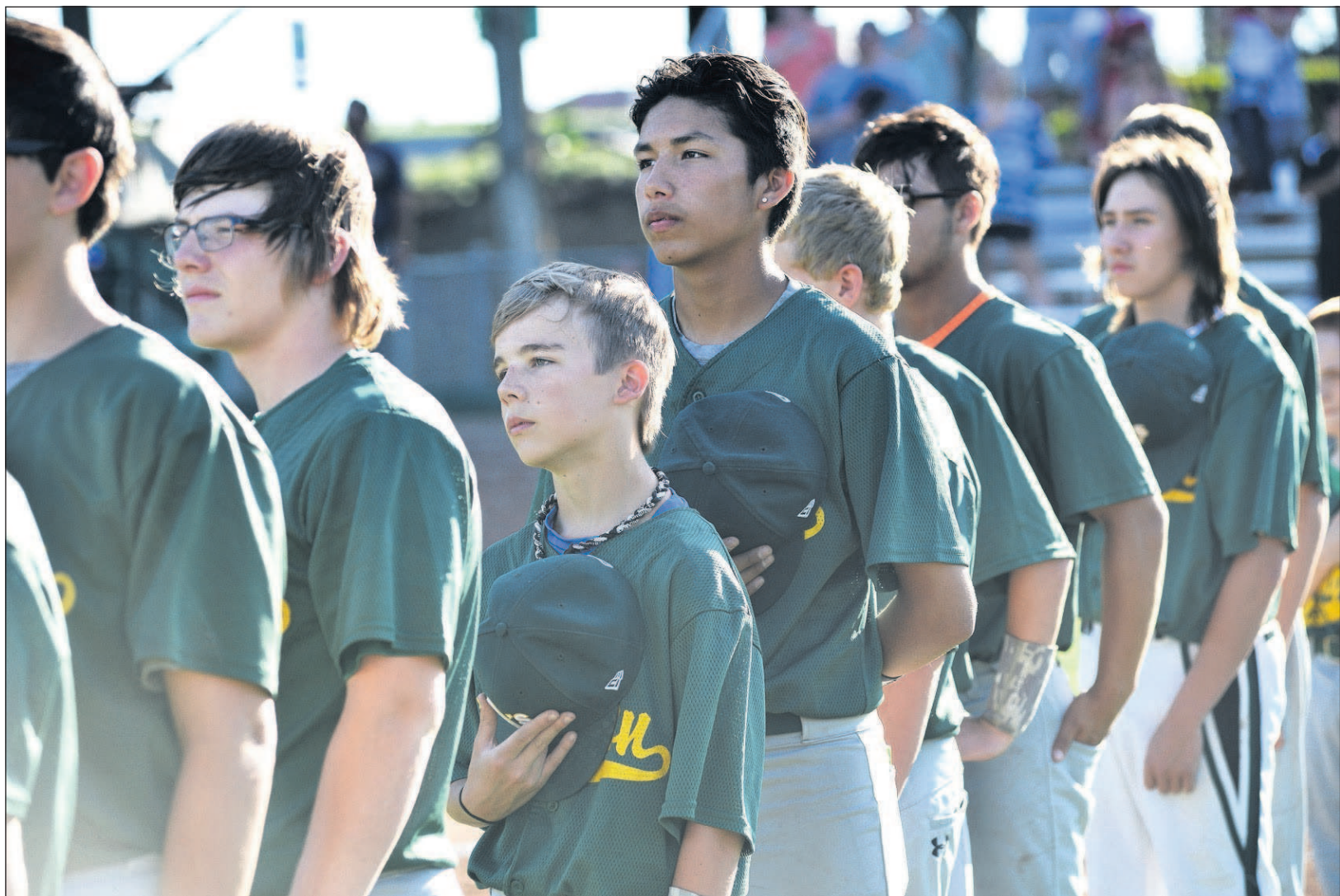
Members of the Thompson RV A's hold their hats over their heart during the National Anthem before the start of the Pendleton Babe Ruth Baseball League's championship game.