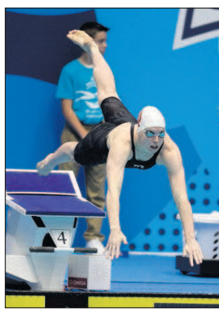
Lilly King starts the women's 50-meter breaststroke at the U.S. swimming national championships in Indianapolis, Thursday, June 29, 2017.