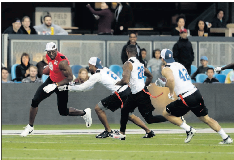
Team Owens' Terrell Owens, left, carries the ball after a catch during a flag football exhibition game Tuesday, June 27, 2017, in San Jose, Calif.

"It's something different," said Vick, who