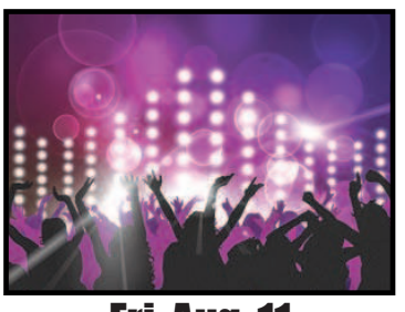
Fri. Aug. 11 Latino Night TBA