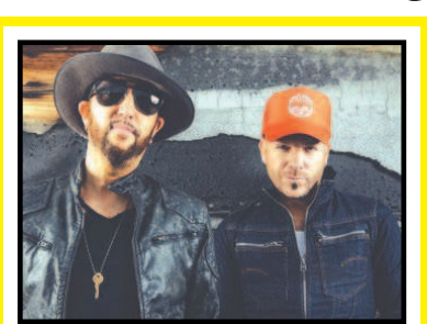
Tues. Aug. 8 • 9pm LOCASH