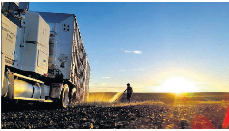
Cleaning out a cattle truck can offer its own kind of beauty.

It was slow and steady, and everything I hadn't allowed myself to experience in months. It was me — chasing light with water and allowing myself to rest in the midst of it all — with no comparison, no competition, and no desire for approval. I climbed from one deck to another, washing away the filth, stomping ever so softly as I made my way through the puddles left behind.