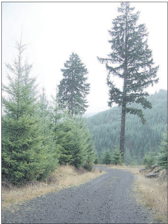
EO Media Group

The counties argue that a 1998 rule change emphasizes environmental and recreational values over timber harvest, thereby violating