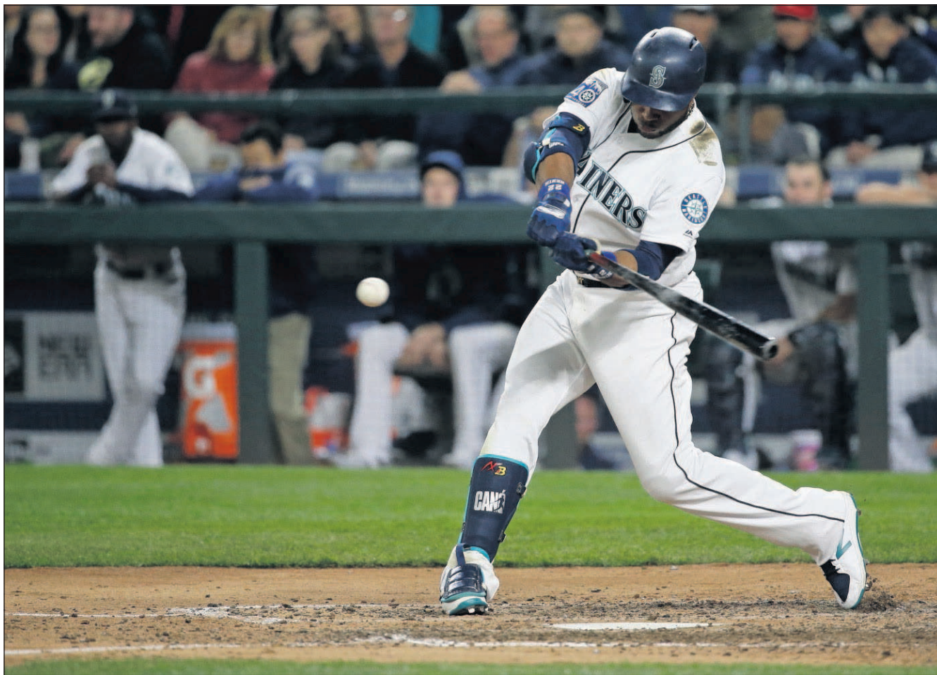
Seattle Mariners' Robinson Cano hits a two-run double against the Detroit Tigers during the seventh inning of a baseball game, Wednesday, June 21, 2017, in Seattle.

Mike Zunino walked and Jean Segura, just activated from the disabled list,