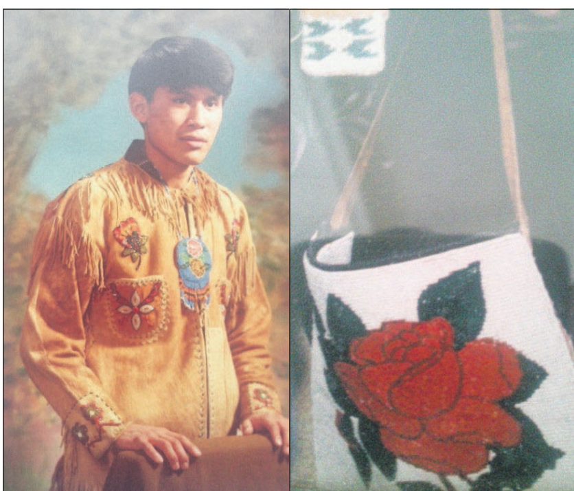
Pendleton and Umatilla tribal police recovered about 60-65 percent of the American Indian regalia and artifacts stolen May 31 from an unlocked storage shed in Pendleton.

The Pendleton chief also said storage unit thefts can be tough to crack. People sometimes pack stuff in a unit and won't check it again for weeks, months or even years. And plenty of storage facilities lack surveillance cameras.