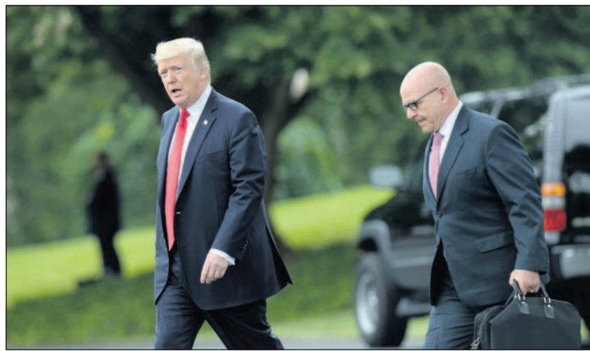
President Donald Trump walks with National Security Adviser H.R. McMaster to Marine One on the South Lawn of the White House in Washington, Friday.

The president has denied that he has any nefarious ties to Russia and has also disputed that he's attempted to block the investigation into his campaign's possible role in Russia's