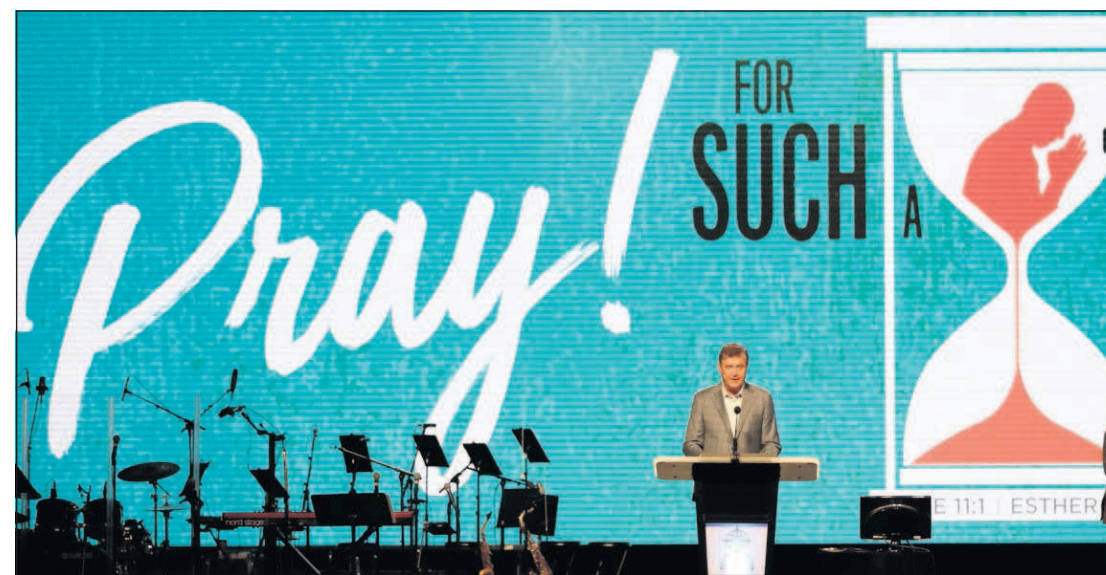
al meeting, Tuesday in Phoenix.

'We are saying that white supremacy and racist ideologies