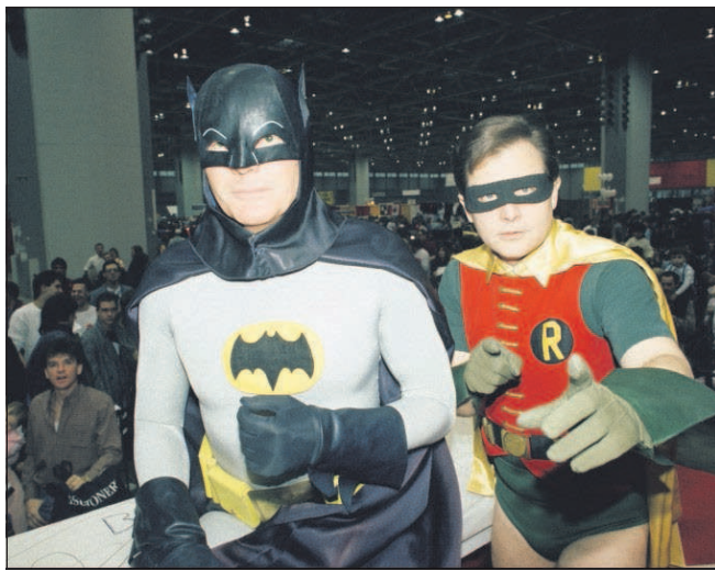
In this Jan. 1989 file photo, actors Adam West, left, and Burt Ward, dressed as their characters Batman and Robin, pose for a photo at the "World of Wheels" custom car show in Chicago.