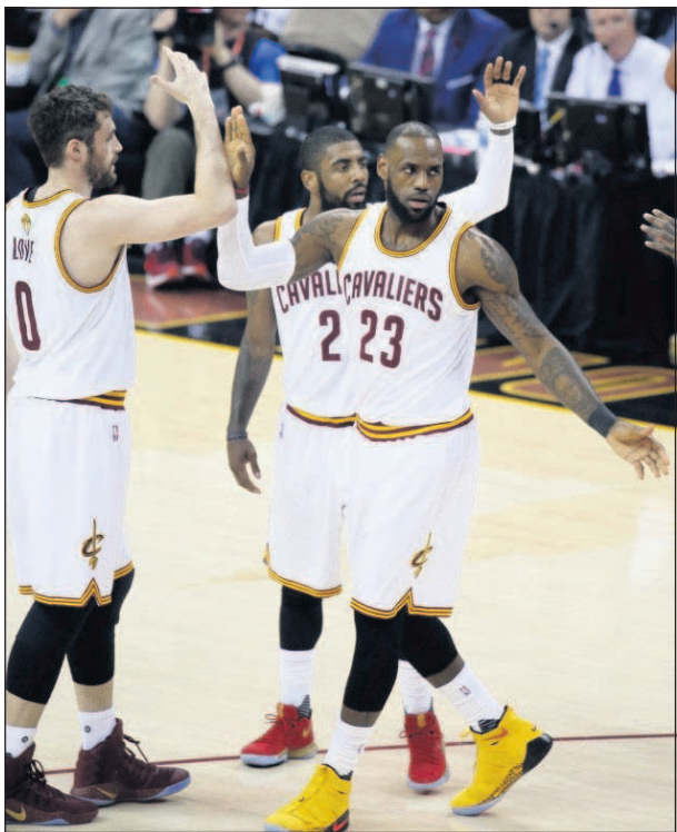
Cleveland Cavaliers forward LeBron James (23) celebrates with Kevin Love (0) and Kyrie Irving (2) during the first half against the Golden State Warriors in Game 4 of NBA Finals in Cleveland on Friday.