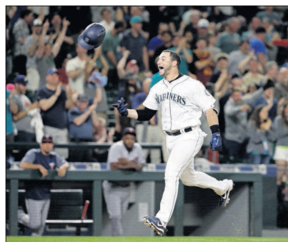
Seattle's Mike Zunino heads home on his two-run, walk-off home run against Minnesota in the ninth inning of Wednesday's game in Seattle.