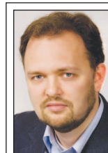
ROSS DOUTHAT Comment

I’ll answer that challenge myself: My own alarm over climate change has gone up modestly since the Obama-era cap-and-trade debates, as the decade or more in which observed warming was slow or even flat — the much-contested warming “pause” — has