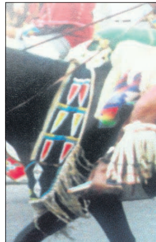
Irreplaceable American Indian regalia and artifacts were recently stolen from a storage unit in the 200 block of Southeast Frazier Avenue, Pendleton.