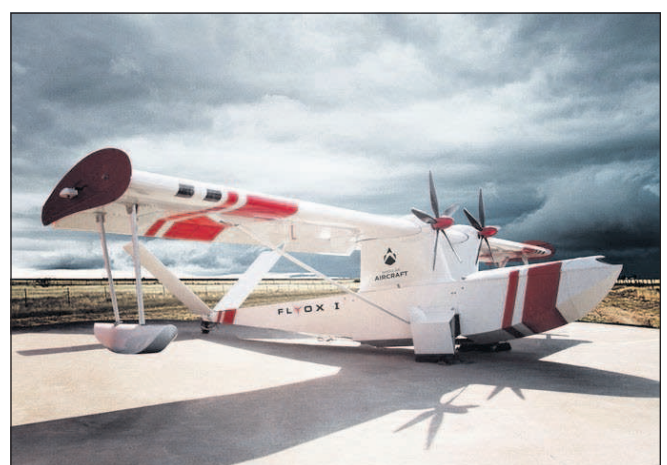
The Flyox I has a maximum takeoff weight of 8,378 pounds with a 45-foot wingspan and 145 mph cruising speed. It is being developed to assist in firefighting.

The manager of Pendleton's Unmanned Aerial Systems Range said he expects to hear next week if the Flyox I, a massive Spanish-made drone designed to assist with firefighting, will run test flights at the Eastern Oregon Regional Airport.