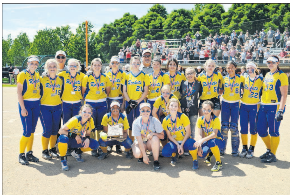
The Pilot Rock softball team poses with its second-place trophy and medals after finishing runner-up to North Douglas at the OSAA 2A/1A Softball State Championship on Friday at OSU Softball Complex in Corvallis.