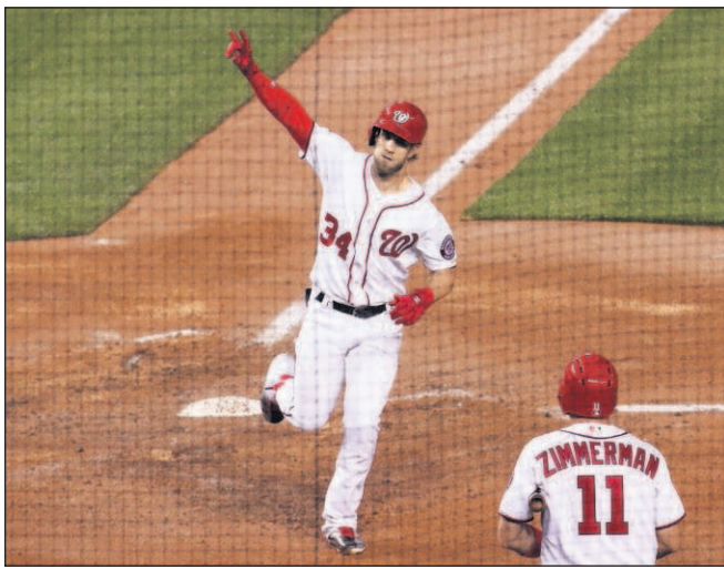
Washington Nationals Bryce Harper (34) waves to the crowd after hitting a home run during the fourth inning of a baseball game against the Seattle Mariners in Washington, Tuesday, May 23, 2017. Nationals Ryan Zimmerman (11) waits on deck.

Offense stays quiet in Seattle's fourth straight loss