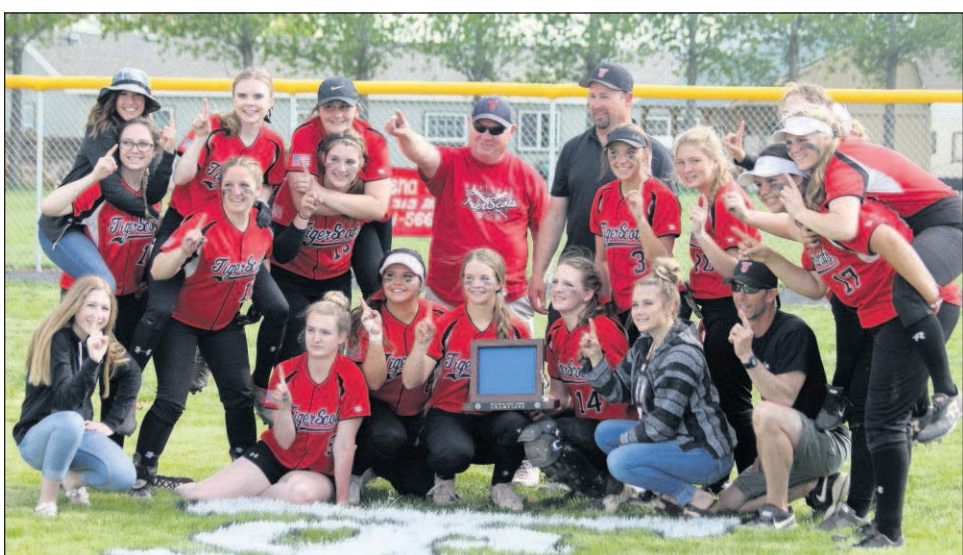
The Weston-McEwen TigerScots pose with the Class 3A Special District 1 championship trophy after defeating Irrigon 4-1 in the district championship game on Saturday in Athena.