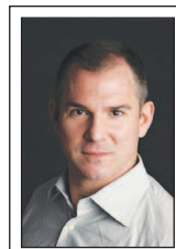
FRANK BRUNI Comment

He gives his lieutenants lies to peddle, creates avoidable messes and then rails if underlings don't grab their mops and clean up with sufficient cheer and success. Aides will suck up a whole lot for proximity to power,