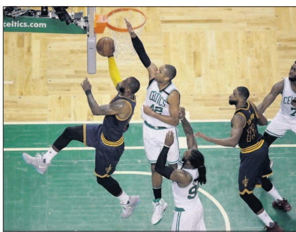
Cleveland's LeBron James, left, drives for a layup in front of Boston's Al Horford (42) during Game 1 of the NBA's Eastern Conference finals on Wednesday in Boston.