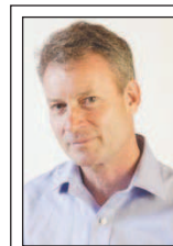
TIMOTHY EGAN Comment

The civilized world was recently appalled at Trump’s outreach to tyrants from North Korea, the Philippines and Turkey. This week, we find out that the family of the president’s son-in-law, Jared Kushner, offered Chinese business owners a path to U. S. citizenship if they invested in a Kushner property. And a White House visit of Russian political operatives