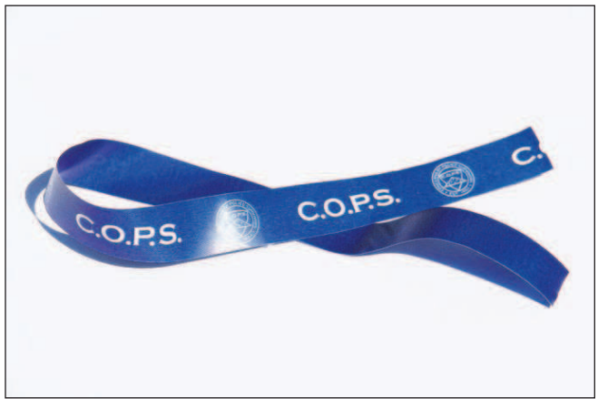
The Concerns of Police Survivors organization created these ribbons for people to display on their vehicles to support police officers during National Law Enforcement Appreciation Week, May 14-20.

The ribbons are printed with the word "COPS," for "Concerns of Police Survivors," an organization dedicated to supporting police officers and colleagues affected by deaths in the line of duty. The ribbons are free and are furnished by this