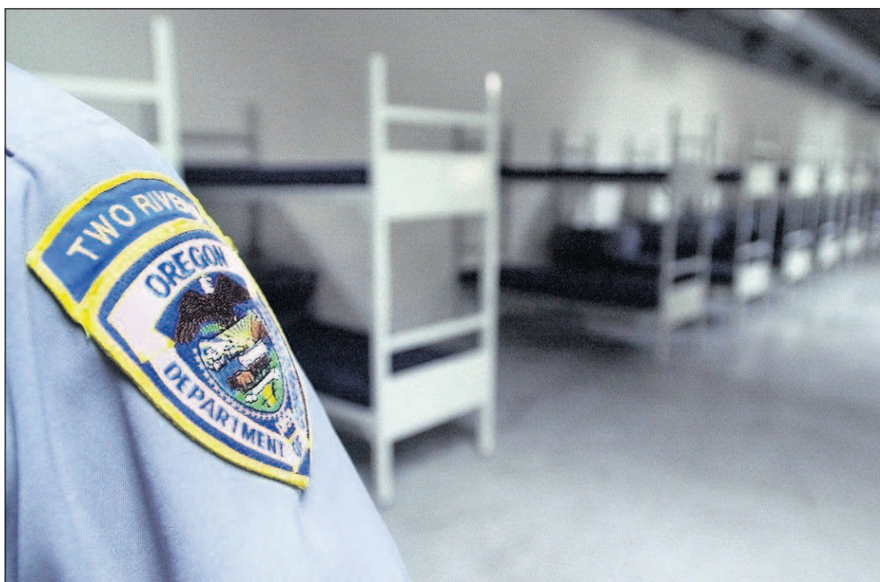
Inmates at four state prisons, including Two Rivers in Umatilla, have filed a class action lawsuit accusing the prisons of serving sub-standard food.

Bridgette Lewis, an inmate at Coffee Creek in July 2013, worked in warehousing in