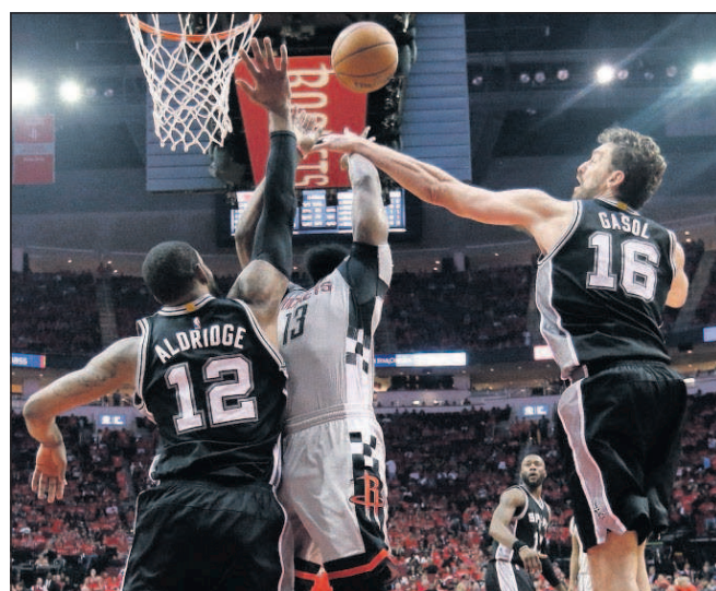
San Antonio Spurs center Pau Gasol (16) blocks the shot of Houston Rockets guard James Harden (13) as forward LaMarcus Aldridge defends during the second half in Game 6 of an NBA basketball second-round playoff series, Thursday, May 11, 2017, in Houston.

UP NEXT Game 1 of the West finals is Sunday at Golden State.