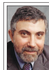
PAUL KRUGMAN Comment

Even without a proper analysis, however, it's clear that Trumpcare breaks every promise Republicans ever made about health. Deductibles will rise, not fall, as insurers are set free to offer lower-quality coverage. Premiums may fall for a handful of young, healthy, affluent people, but will rise and in many cases soar for those who are older (because age spreads will rise), sicker (because protection