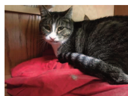
Silver is a 7 year old male Domestic Shorthair Mix

Available for adoption at PAWS 517 SE 3rd St.