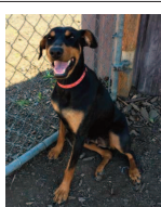
Hope is a 3 year old female Doberman Pinscher Mix

Available for adoption at PAWS 517 SE 3rd St.