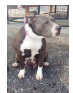
Macey is a 3 year old female Terrier/ American Pitbull

Available for adoption at PAWS 517 SE 3rd St.