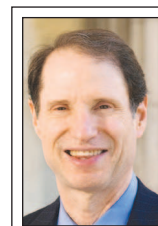
RON WYDEN Comment

More than 1 in 4 Oregonians are enrolled in Medicaid — and that share exceeds one in three in some rural counties.