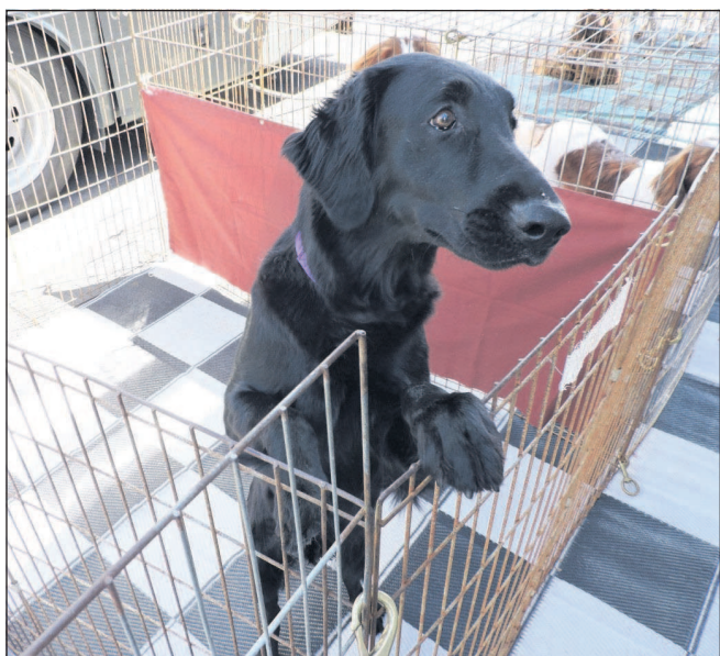
Sammie, a flat-coated retriever, jumps for attention outside the Pendleton Convention Center ahead of this weekend's annual Walla Walla Kennel Club Dog Show.