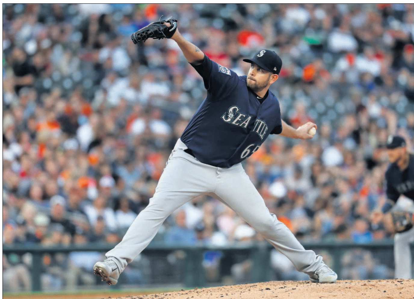
Seattle Mariners pitcher James Paxton throws against the Detroit Tigers in the second inning of a baseball game in Detroit, Wednesday, April 26, 2017.