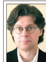
BYRON YORK Comment

It doesn't take a mind reader to interpret that as a vote of no confidence. Members of