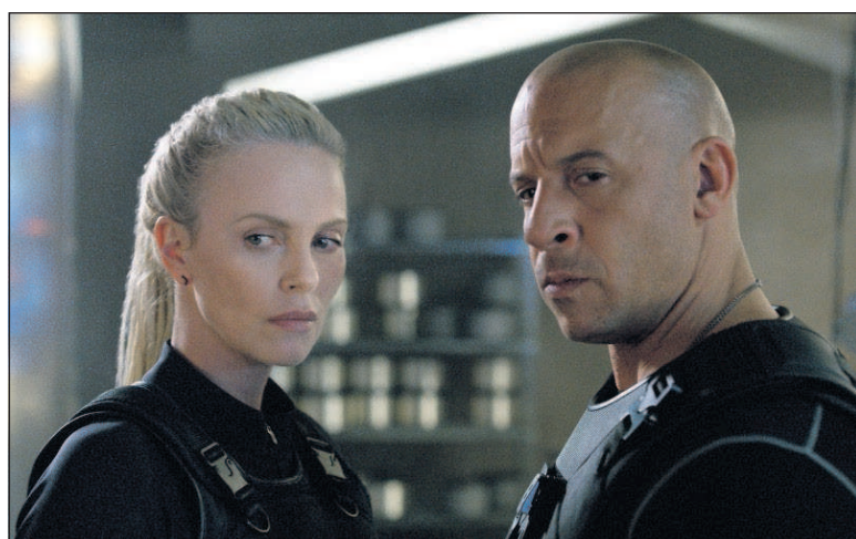
This image released by Universal Pictures shows Charlize Theron, left, and Vin Diesel in "The Fate of the Furious."

"F8" begins with Dom (Vin Diesel) and Letty (Michelle Rodriguez) honeymooning in Havana. Charmed by the city's car culture, they're soon in a street race — a thrilling sequence with motorcycles swooping in to stop traffic as the drivers speed